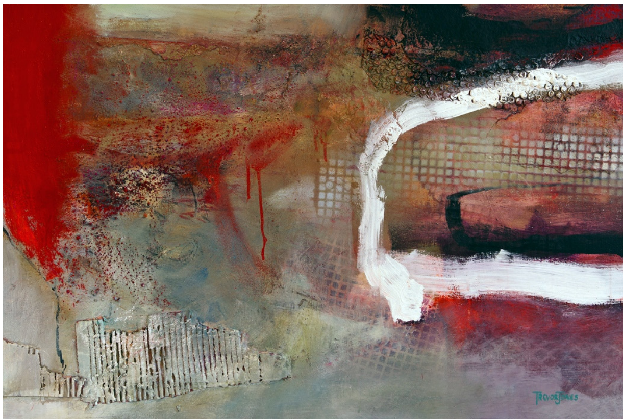
Trevor Jones Who's Got a Match Mixed media on board 68cm x 98cm £1800