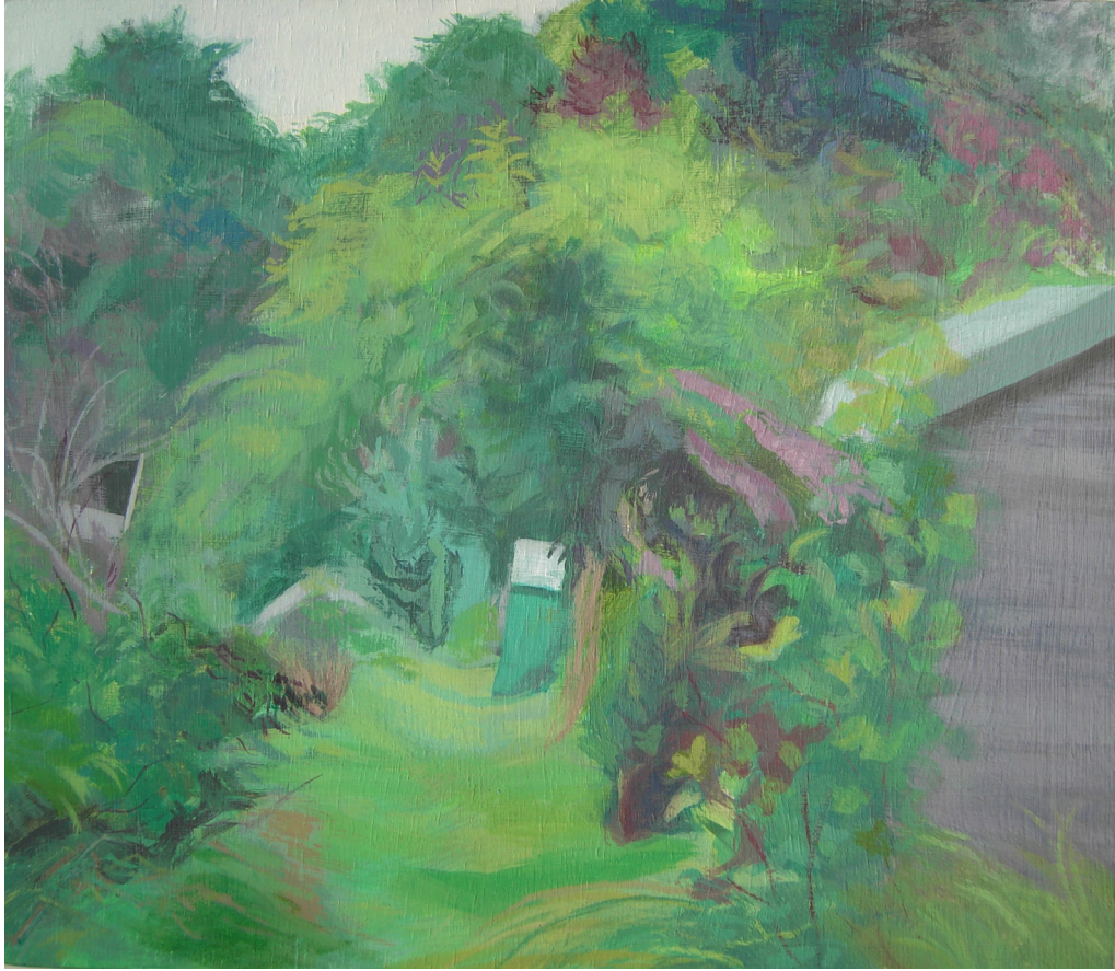
Carolyn Burchell Midmar Allotments Acrylic on board 33cm x 35cm £500