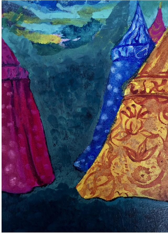
Anne Forte Golden Tent Oil on linen 24cm x 18cm £250