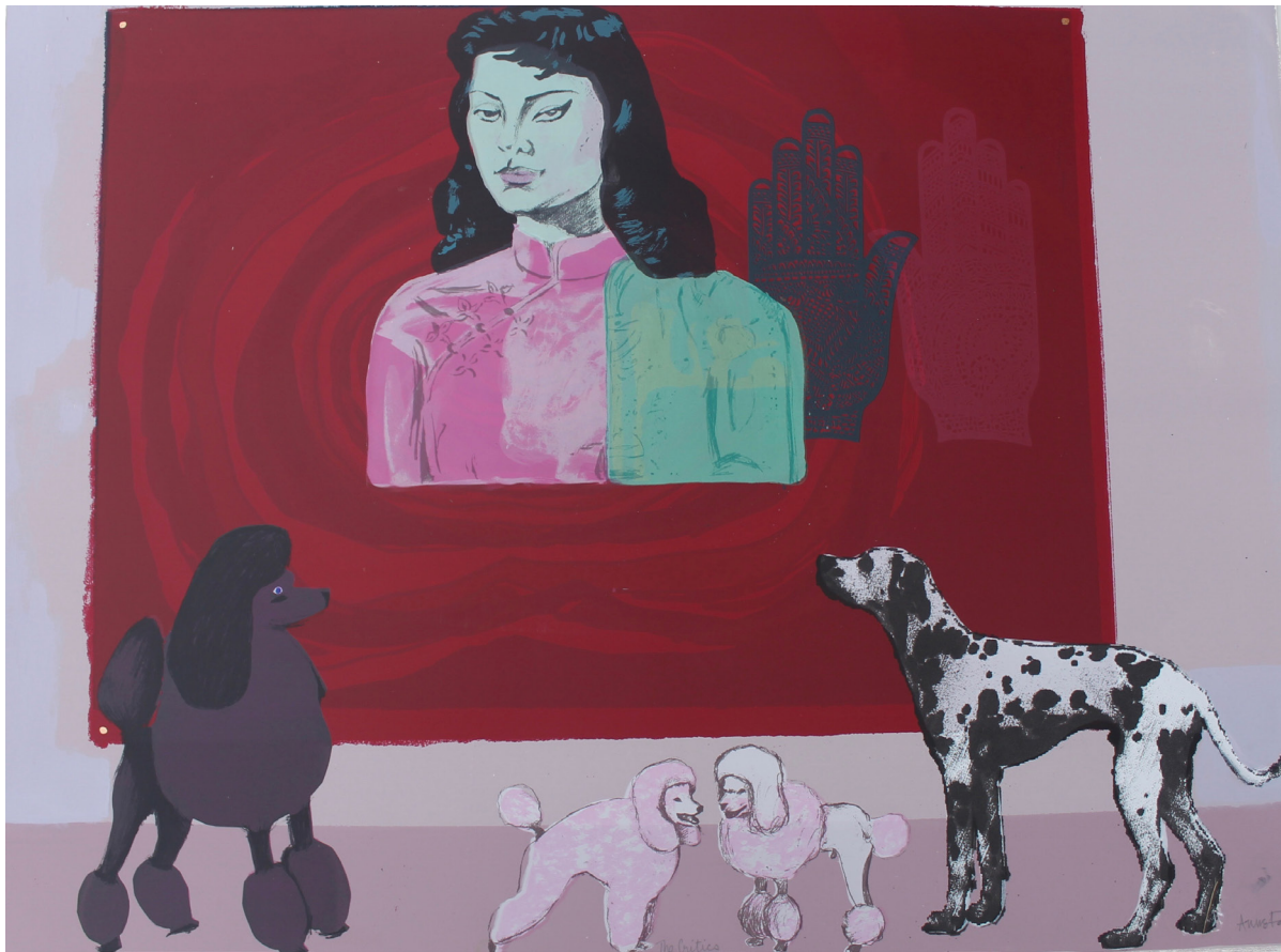
Anne Forte The Critics Screenprint 57cm x 76cm £450