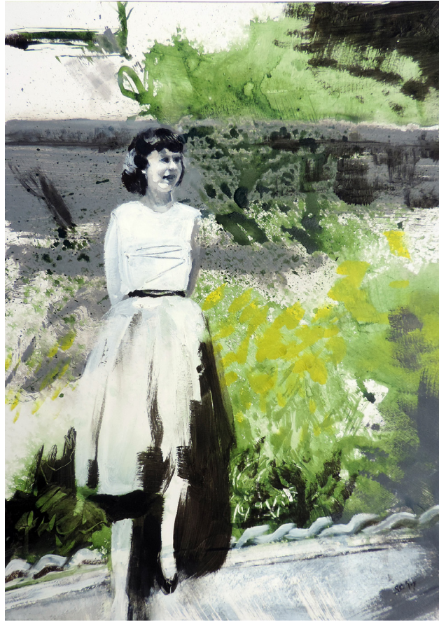
Sheila Chapman Walled Garden Acrylic ink and paint 54cm x 41.5cm £320