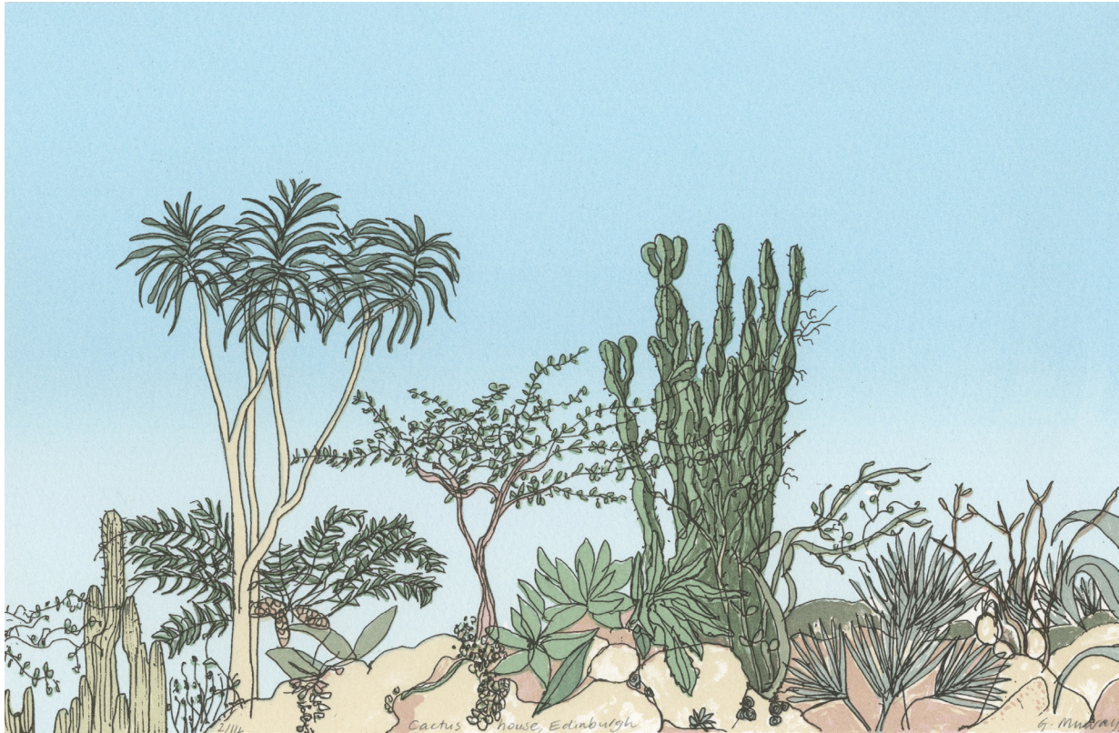
Gillian Murray Cactus House Screenprint 33cm x 43cm £195 framed; £150 unframed