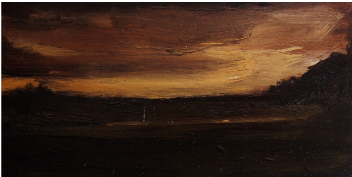
Hannah Mooney Little Landscape at Dusk Oil on board 8cm x 11.5cm £380