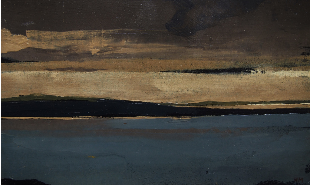
Hannah Mooney Dark Seascape Study I Oil on board 12.5cm x 20.5cm £500