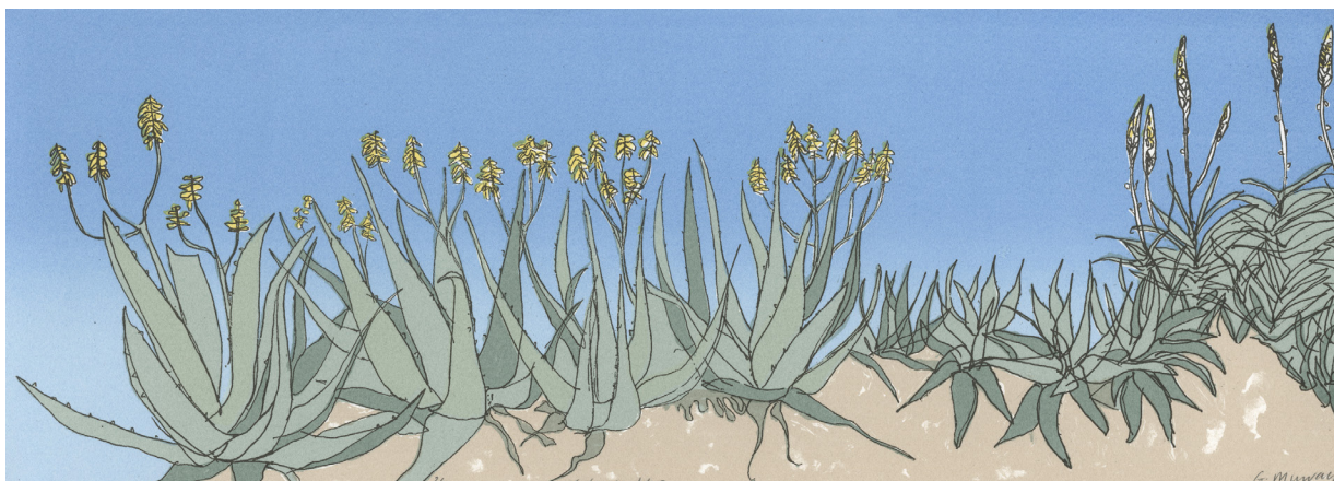
Gillian Murray Valencia Blue Screenprint 32cm x 60cm £235 framed; £180 unframed