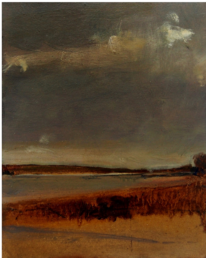
Hannah Mooney Seascape Lough Swilly Oil on board 16cm x 13cm £500